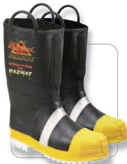
HELLFIRE™ STRUCTURAL AND HAZMAT FF BOOTS