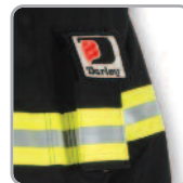
RADIO POCKET WITH FLAP