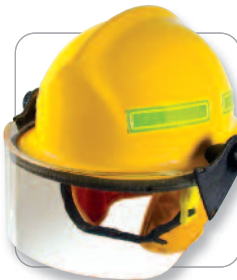
FIRE-DEX® 911™ HELMET