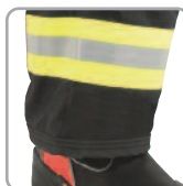
ARASHIELD PANT CUFFS & KNEES