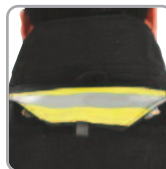
DRAG RESCUE DEVICE