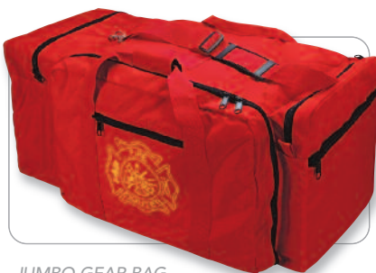
JUMBO GEAR BAG