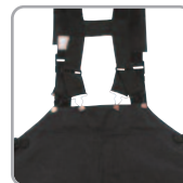
HIGH BACK PANTS W/SUSPENSERS