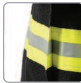
ACTION BACK, KNEES & ELBOWS