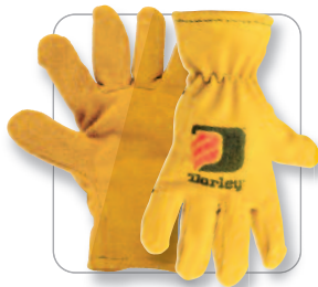
DARLEY GOLD GAUNTLET GLOVES