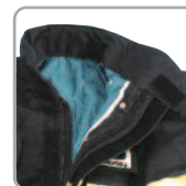
ZIPPER W/VELCRO® OUTER CLOSURE