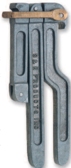
AM096 Hose Clamp

Made from high-quality cast aluminum and brass. Off-set handle allows the user to more easily operate while wearing gloves. Designed to be used with today's light weight single jacket wildland 1" and 1 1/2" fire hose. When clamped on the hose, it locks securely and safely in the closed position. Ship. wt. 2 lbs.