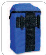
AB397 Fire Shelter with Case (Standard Size)