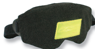
See Page 66 for Optional Nomex® HeatSleeve™