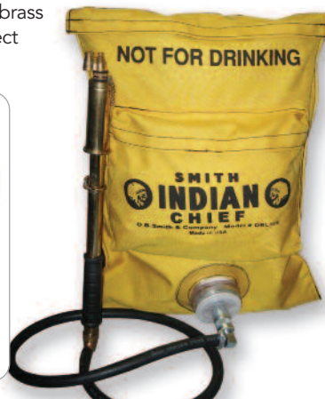
BL243 Indian Chief Dual Bag Fire Pump