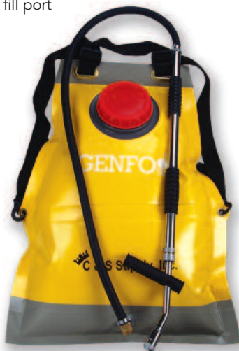
AW226 Genfo Back Pack System