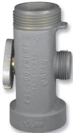
AJ478 Water Thief In-Line Tee Valve

Designed to be installed at intervals in long lines to provide independently controlled outlets for 1" branch lines with full 1/2" waterway. When used in fire-line sprinkler systems, these valves provide the ability to adjust water flow to each sprinkler in the line. Valuable for mop-up work and for filling canteens and back pumps. Meets U.S. Forest Service specifications. 1 1/2" NH x 1" NH. Ship. wt. 2 lbs.