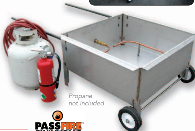
Propane not included