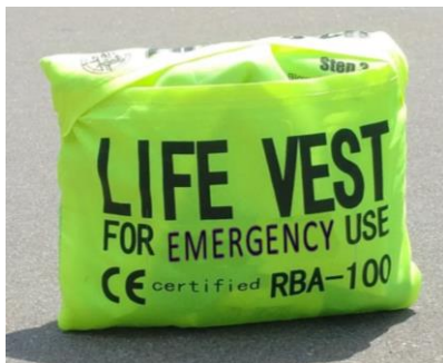
Repacks into Its Belt Pack