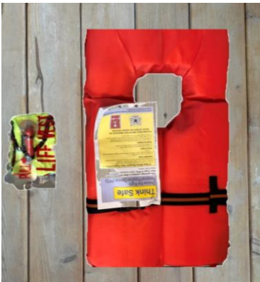
Size Comparison - Type II Keyhole Vest