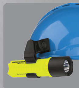
Slot Mount (mounts to either side of helmet)