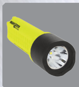
High-efficiency deep parabolic reflector