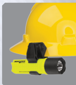
Clip Mount (mounts to either side of helmet)