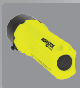
Single tail switch

cETLus, ATEX, and IECEx listed Intrinsically Safe