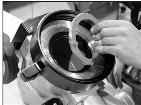
3) Remove old Valve Seat