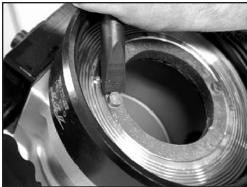
2) Unscrew and remove seal retainer.