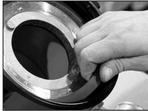
1) Remove Old Hose Gasket

Needed: new valve seat, small amount of white grease, a pointed pin, wrench, Tool #THA405 and seal retainer remover tool (available from tft if needed).