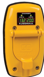
Super Auto Eject Deluxe Cover*- Digital Display Model #: 091-55-194E-XX

*Color options: (YW) Yellow, (RD) Red, (WH) White, (GR) Gray, (BL) Blue and (BLK) Black