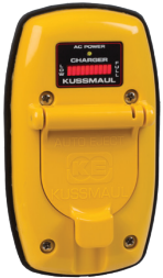
Super Auto Eject Deluxe Cover*- Bar Graph Model #: 091-55-234-XX

Status Center Display* in Watertight Case